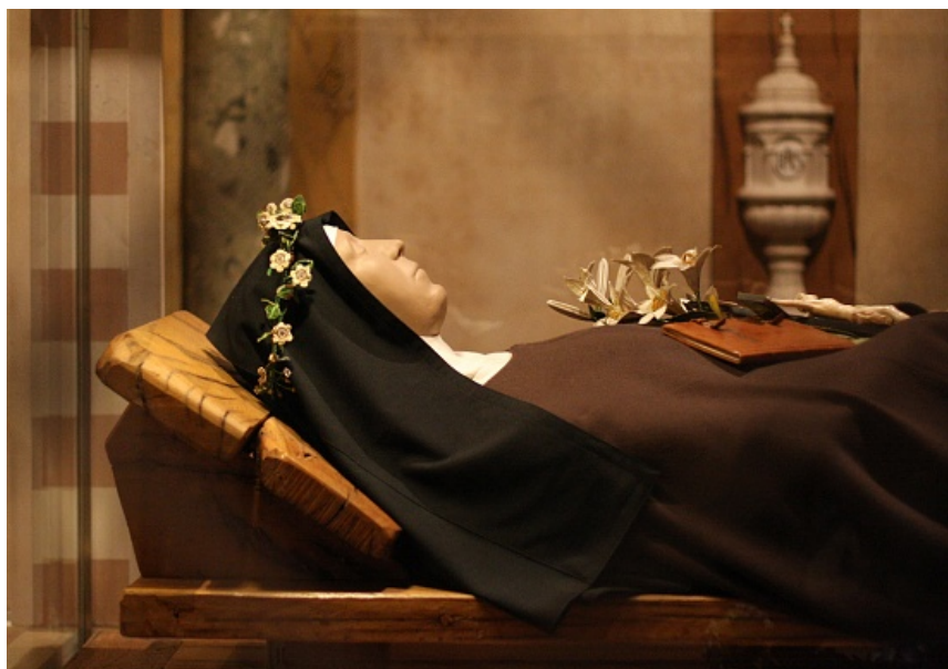
Top: Basilica of Saint Clare Bottom: Saint Clare's body in the Basilica Crypt