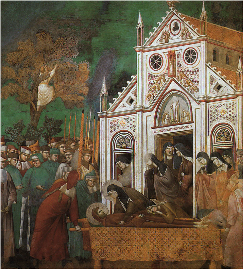
Assisi's two great saints together in Giotto's fresco on the wall inside the Basilica of Saint Francis (St. Clare mourns the passing of St. Francis)