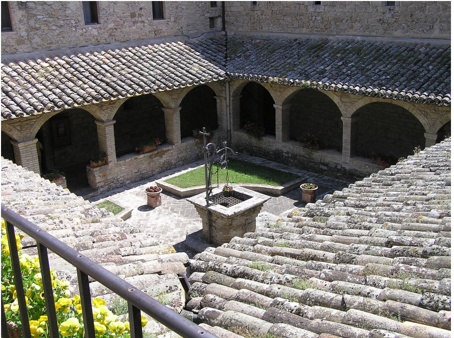
Top: Assisi Bottom: Church of San Damiano - Cloisters