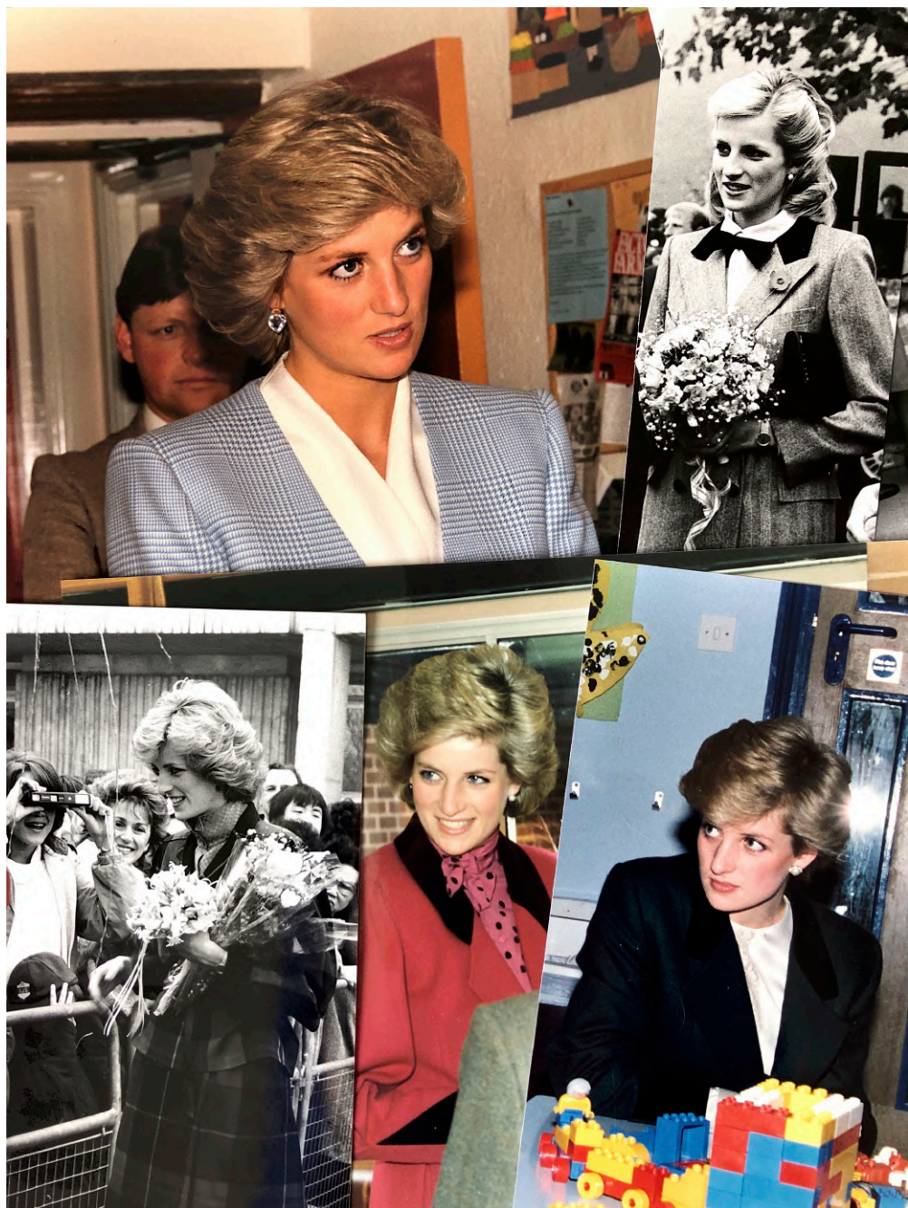
H.R.H Diana Princes of Wales