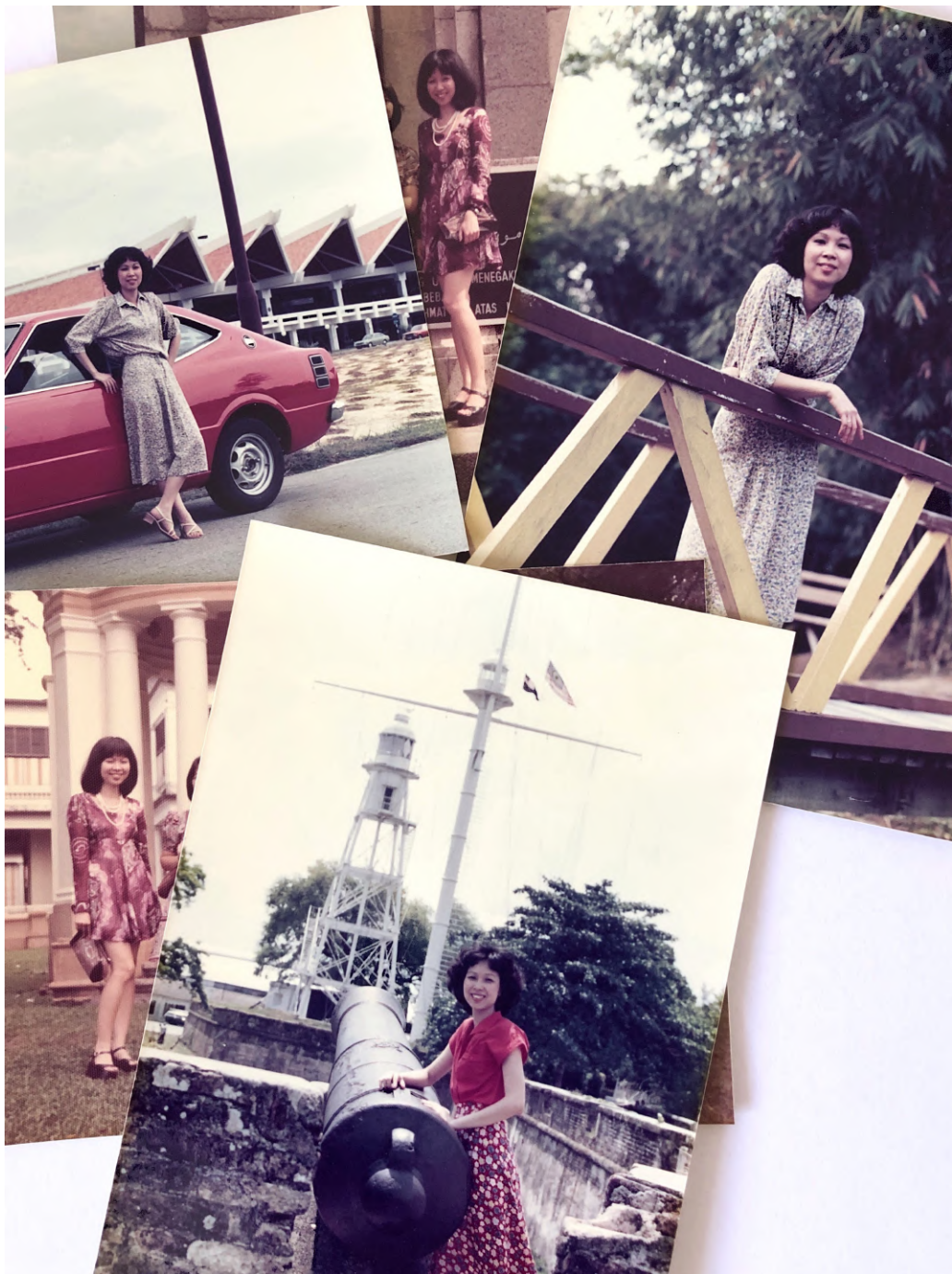
B in Penang 1978/79