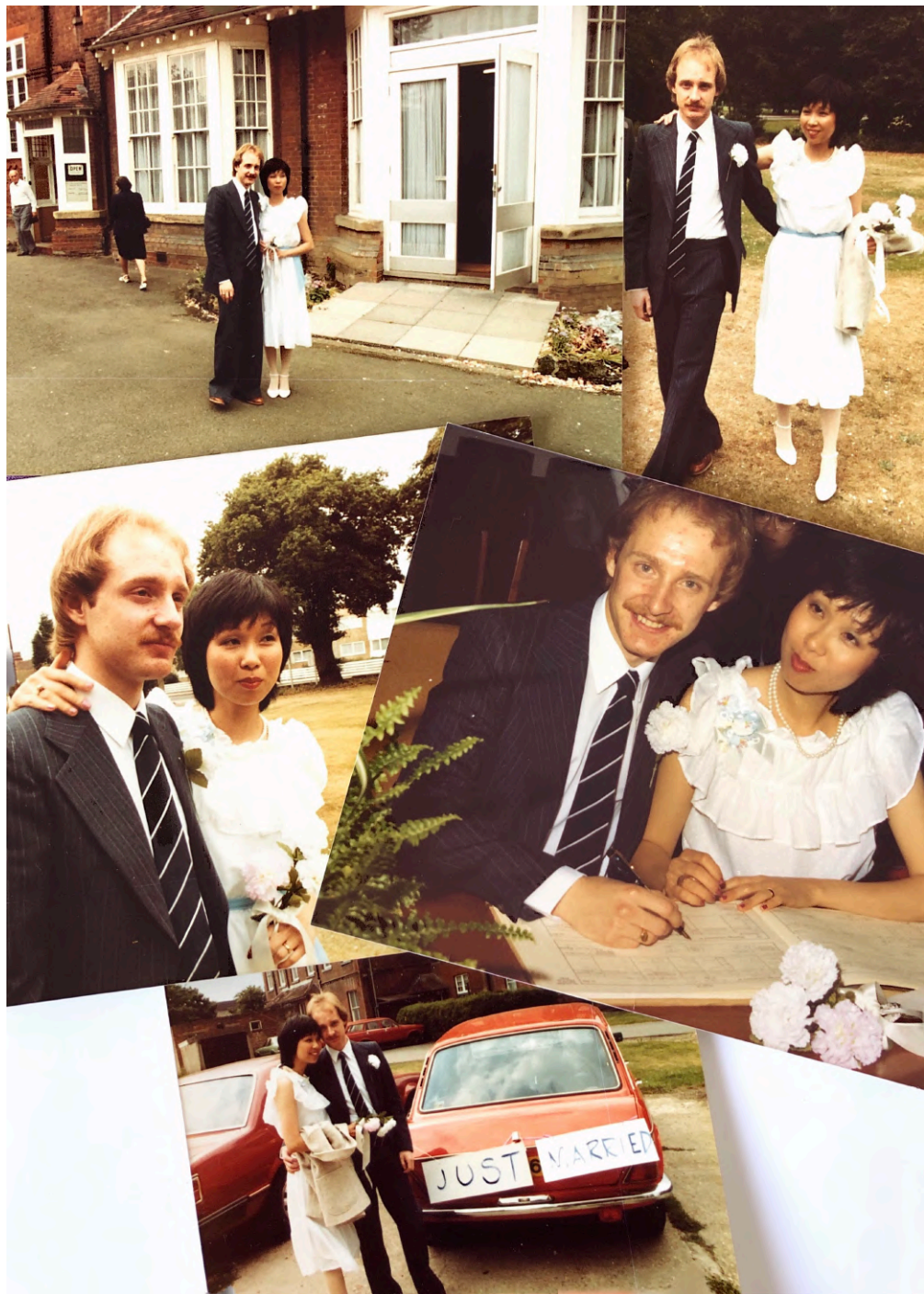
September 1st 1981 - Barkingside Registry Office